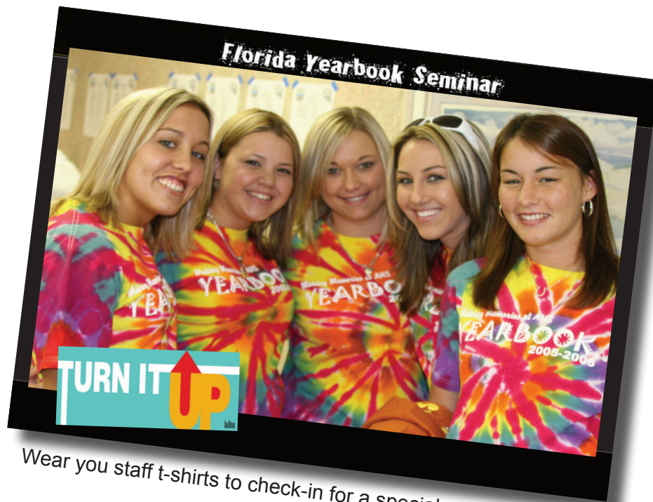
Wear your staff t-shirts to check-in for a special group picture!

Get additional info at: floridayearbookseminar.com